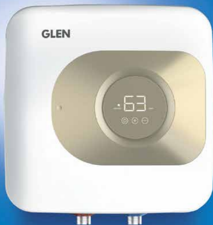
DIGITAL WATER HEATER WH 7055 Available in 15 & 25 L

Now enjoy precise temperature control at the touch of a button !