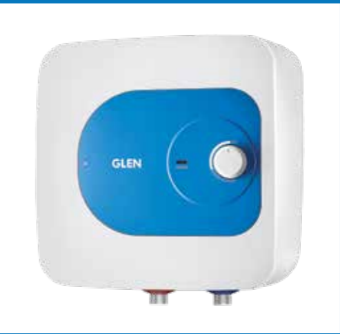
Available in 6, 10, 15 & 25 L

This smart and compact, square Glen Water Heater enhances the aesthetics & adds a new charm to your bathroom. The intelligent safety features like dry heat protection, high pressure withstanding capacity and high grade thermostat cut off ensure safety for you and your loved ones over the years.