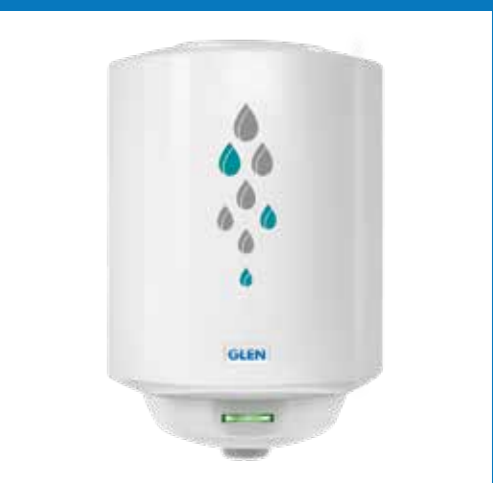
Available in 6, 10, 15, 25 & 35 L

This classic Water Heater, with a smart and elegant metal & ABS body, blends in neatly in your bathroom. It houses all the top of the line features and is designed to give high power performance. Now enjoy a continuous hot shower with faster heating and maximum safety for years.