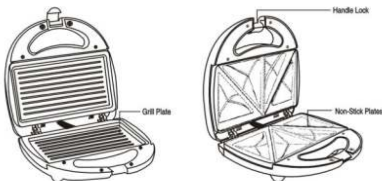
Sandwich Maker Grill