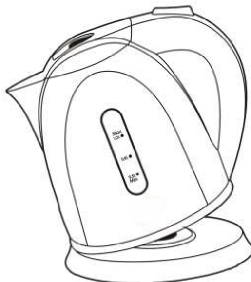
KETTLE GL 9007